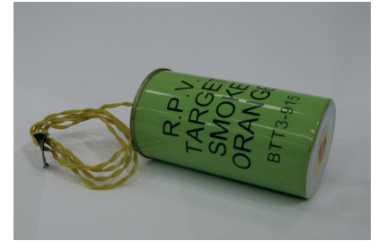
Fig 1: QTS Smoke Tracking Flare