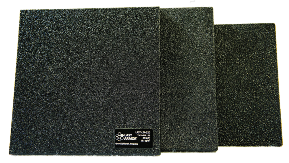
LAST Armor aircraft panels