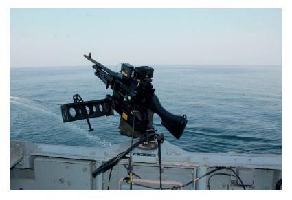
POINTER Optical Sight integrated with General Purpose Machine Gun

Can be integrated with all crew-served direct fire weapons and light vehicles