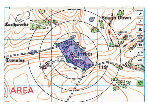
POINTER - land base station display

POINTER can also be used in conjunction with remotely operated, robotic and autonomous systems to provide an integrated command and control function for widely distributed assets delivering a variety of effects – from reconnaissance to direct fire support.