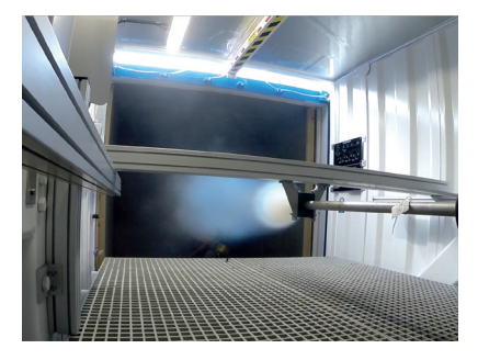
High Flow Rig (HFR)