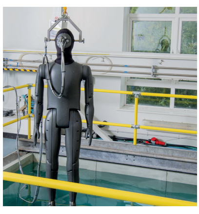
Experimental Diving Tank (EDT)