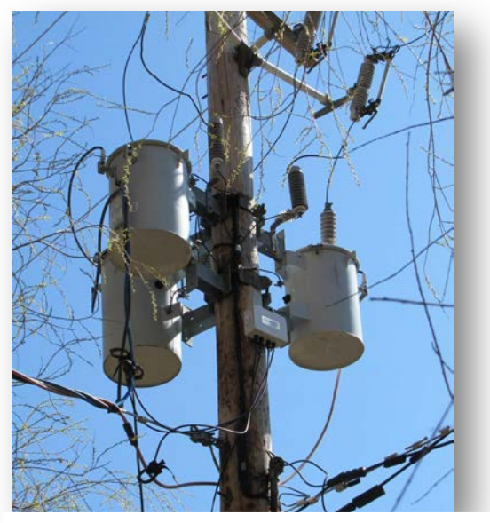
Figure 2: LineWatch-L sensor integrated with a three-phase pole-mounted distribution transformer installation.

The voltage triangulation used by the VDFL technique considerably reduces the patrol zone by pinpointing the faulty lateral tap. The arc voltage amplitude deduced by this technique combined with