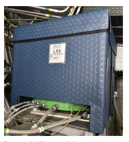
Easy to apply LOX Armor solutions