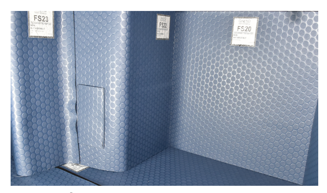
Proprietary LAST Armor® hook and loop fastening for fixed and rotary wing platforms