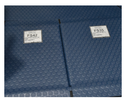
Lightweight composite armor for flight deck, cargo, door and other areas

Our specialty ultra-high-hard steel plate and processing techniques allow for fabrication of complex geometries that would otherwise be unattainable. Stringent testing has shown that QinetiQ's metallic armor solutions exceed ballistic performance requirements and are flight proven on both US and international aircraft platforms.