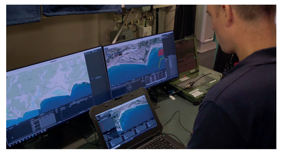
Figure 2 - Three screen based deployment of QUASAR